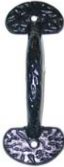
6" Bean End Lift Handle; 300-70225