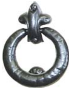
6" LIS Knocker; 4" ring; 300-70055