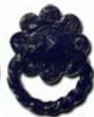
Traditional Ring Pull, LIS Style, Black