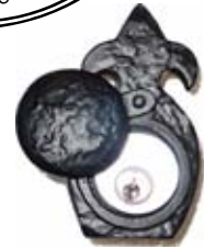
Cylinder Cover; Black Iron 300-70200