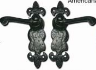
Traditional Collection Carriage Handles, Black Finish