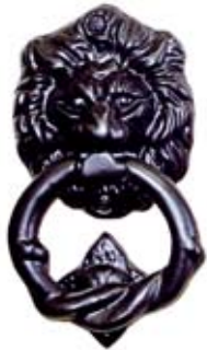
7" Lion Head Knocker, 4" ring; 300-70050; Also available in brass; 300-70051