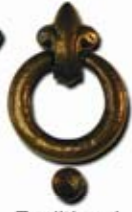
Traditional Knocker LIS Style; Copper