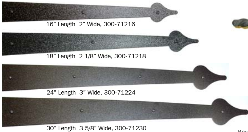
16" Length 2" Wide, 300-71216