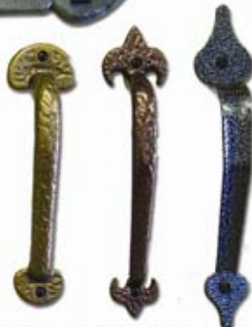
Pull Handles (L to R); Traditional Colonial Bean End, Gold Finish Traditional Fleur De Lis, Copper Finish Americana Spear End, Silver Finish