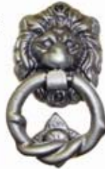
Lion Head Knocker Silver Finish