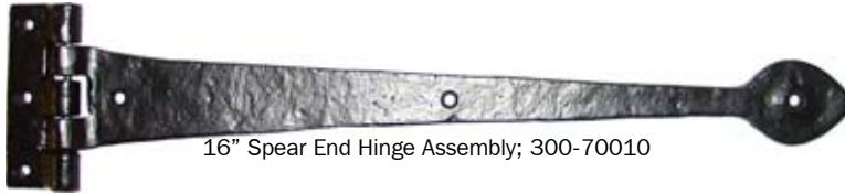
16" Spear End Hinge Assembly; 300-70010