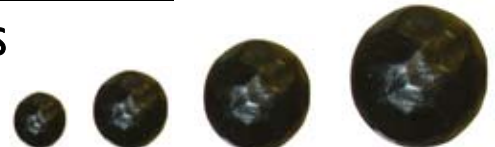
Round Clavos, 2", 1 3/4", 1 1/4", 3/4" Sizes

Also available in 5 Elegance colors. See page CH8 for Elegance finished clavos.