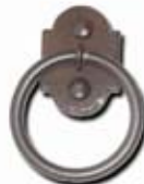
Rustic Ring Pull Dark Earth