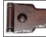
Detail of Butt Pin Hinge End with 3/4" matching Clavo Installed