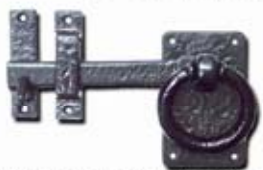
Traditional Latch Kit, Black