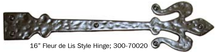
16" Fleur de Lis Style Hinge; 300-70020