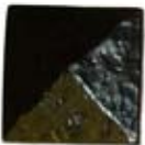
Pyramid Clavos, 2", 1 1/2", 1 1/8", 3/4" Sizes