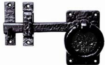
8" Door Latch w/ 3 1/2" Ring; Traditional 300-70401