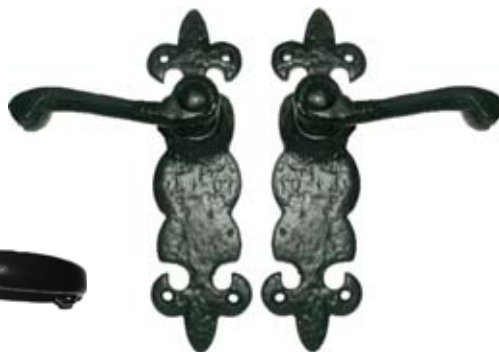
8" LIS Handle Set; 300-70260