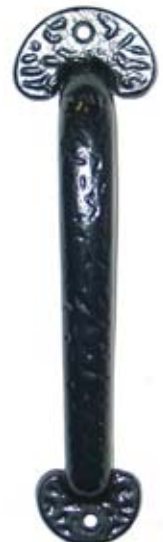
9" Bean End Pull Handle 300-70230