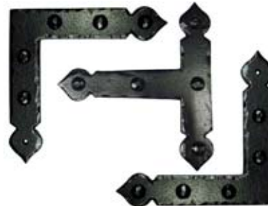
9" L Corner Brackets and 10" x 9" T Brackets (left) lend a beautiful, rustic feel to any door. Shown Black w/decorative Clavos. Available in six Elegance colors. 9" L Bracket, 300-72070, T Bracket, 300-72075