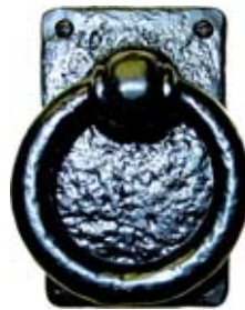
3 1/2" Ring Pull w/ base; Solid Aluminum; 300-70405