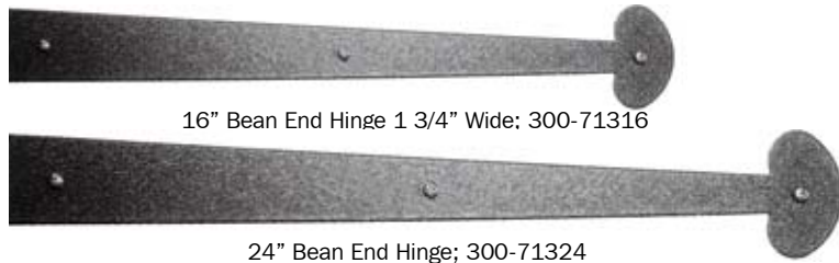
16" Bean End Hinge 1 3/4" Wide: 300-71316

The staple of the Carriage House Line; Spear End Stamped Steel hinges with an old world crinkle finish; Traditional black, or any of our 6 Elegance Colors