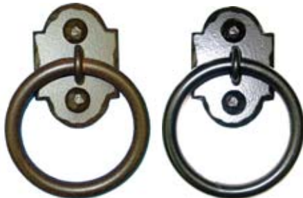
4 1/2" Ring Pull; Dark Earth or Black; shown installed w/ coordinating clavos; 300-72100

All Rustic Hardware is made of sand cast, rust-free solid aluminum; Mount with Clavos, Door Studs or Screws; See Page CH8 to order