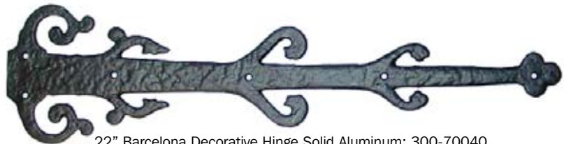
22" Barcelona Decorative Hinge Solid Aluminum; 300-70040