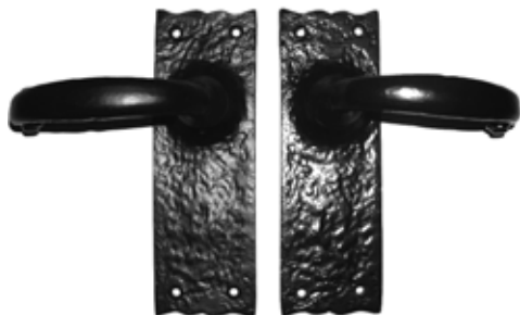
6" Handle Set (non-operating); 300-70250