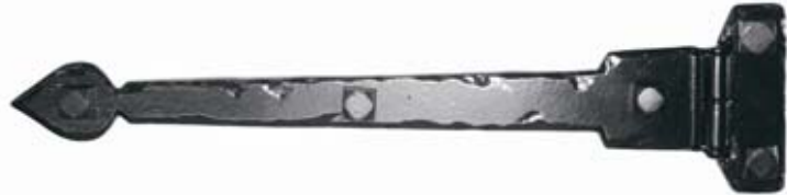
Rustic Hinge Assembly is perfect for wood doors with raised end stiles. Includes 16" hinge with offset end & dummy hinge plate. Black (shown), Dark Earth (see detail), or any Elegance color. Attach with Clavos (see detail), Door Studs, (shown above) or Screws. 16" Hinge Assembly, 300-72020