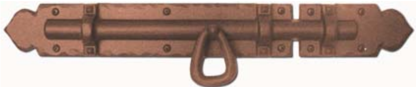
Our 24" Rustic Carriage Door Latch adds old world charm to any wood or steel carriage house door. Available in Dark Earth (shown), Black, or any Elegance Color; 300-72400

All Rustic Hardware is made of sand cast, rust-free solid aluminum; Mount with Clavos, Door Studs or Screws; See Page CH8 to order