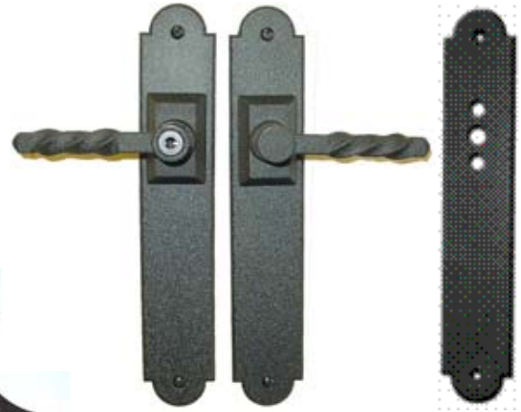
4" Twisted L Handle, blind mount, w/ 11" x 2" Escutcheon Plate 300-71151; Keyed Handle, 300-71150; Non-keyed Handle, 300-71155