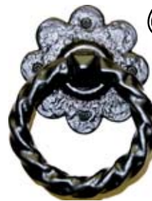
4" Ring Pull; Twisted Solid Aluminum; 300-70435