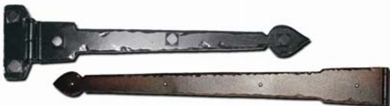
Rustic Collection Spear Hinge Assembly, Black, with Coordinating Nail Studs Rustic Collection Spear End Hinge w/ Butt Pin Only; Dark Earth Finish