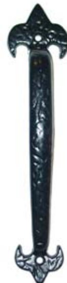
10" LIS Pull Handle 300-70205